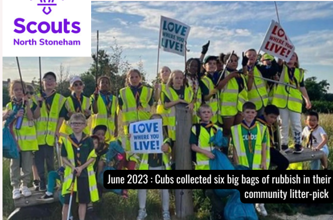
June 2023 : Cubs collected six big bags of rubbish in their community litter-pick

The 75 young members of North Stoneham Scouts have been putting the OUT into ScOUTing big time. By the end of July they will have had the chance to take part in air rifle shooting, climbing, canoeing, hiking, camping, archery, lighting fires and cooking, orienteering, gardening, creature spotting, astronomy, road, fire and personal safety, plus a Marwell Zoo visit. This is only possible thanks to the Group's great team of adult volunteers. Want to join the fun?